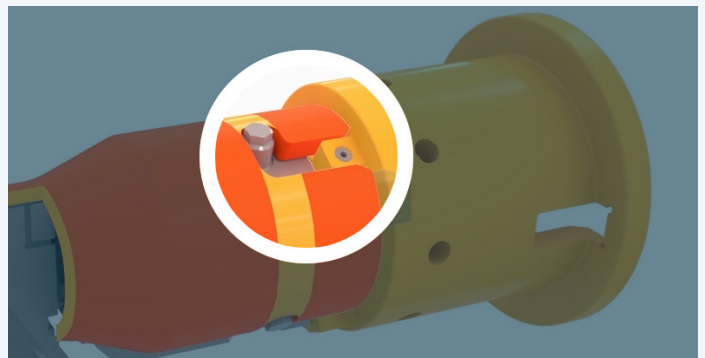
02 // Rotate the ROV torque tool clockwise to lock