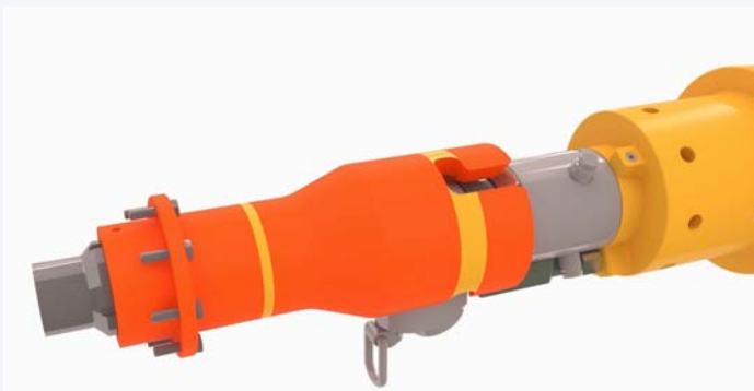
01 // The connector is installed in the inboard receptacle

The HD connector utilizes a dual seal philosophy; a spring energized c-seal as the primary process seal and two heavy duty elastomer T-seals as secondary and seawater barriers.