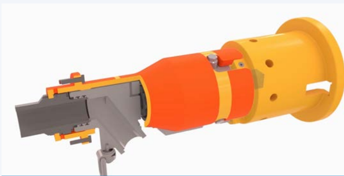
03 // Secondary seals are engaged