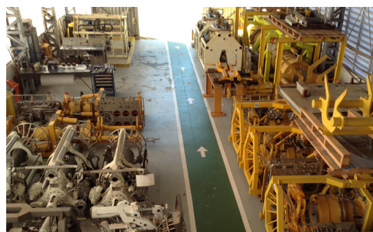
03 // Remote EPRS storage Brazil