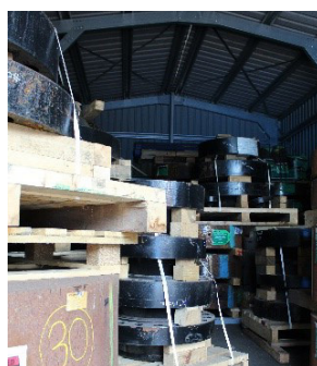
02 // Raw material storage